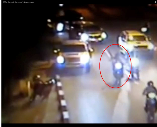
Screenshot from the recorded CCTV footage showing a passenger on a motorbike apparently firing a gunshot into the air.

direction of the police post and stands by the road – he appears to be waiting for someone. Barely 45 seconds later, a pick-up truck with flashing lights arrives at the spot. The waiting man gets into the truck, as do another couple of men – apparently including Sombath. The truck is driven away, apparently following two individuals on a motorcycle, which emerges from near the police post at seven minutes 12 seconds into the video recording.